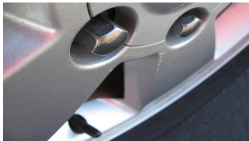
Minor scuffing non-chargeable