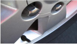
Minor scuffing non-chargeable